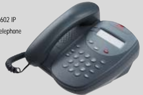
4602 IP Telephone