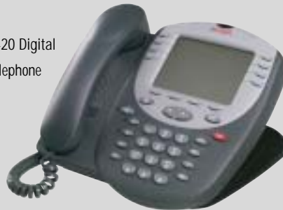
2420 Digital Telephone